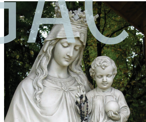
2004 10th Anniversary. Dispersed more than $1,301,405 from endowments. 550 CHS members.