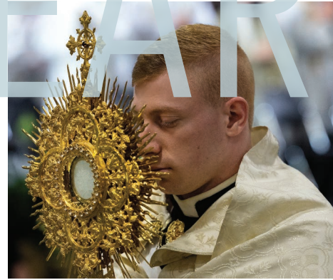
1994-99 Number of endowments grew from 17 to 50. Assets held grew from $105,450 to $6,129,850.