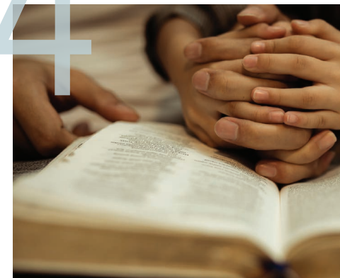
2024 30th Anniversary. Dispersed more than $17.5 million from endowments. 1,700 CHS members.