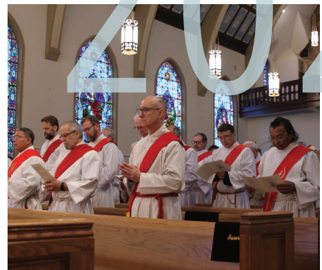
2021-24 Number of endowments grew to 367. Assets held grew to $97,152,042.