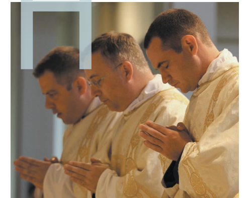
2011-15 Number of endowments grew to 230. Assets held grew to $33,156,202.