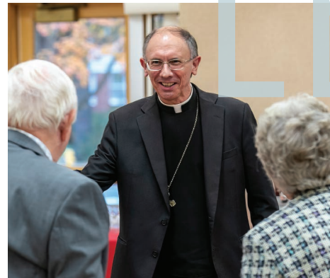
2000-05 Number of endowments grew to 124. Assets held grew to $12,449,675.