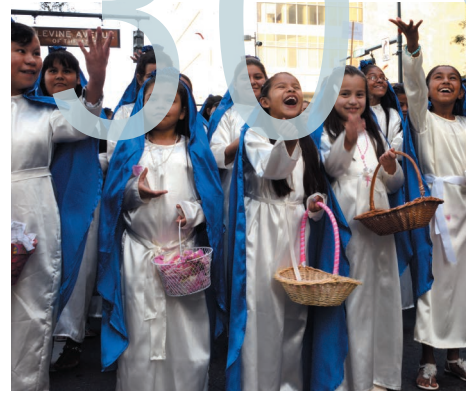
1994 First endowment established to provide funds for programs that support the poor, minority communities and evangelical initiatives.