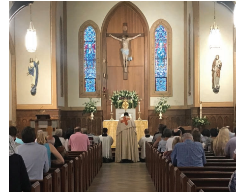
2001 Established grant award process using four of the Foundation's endowment funds. From 2001-24 has awarded 426 grants totaling $1,212,000.