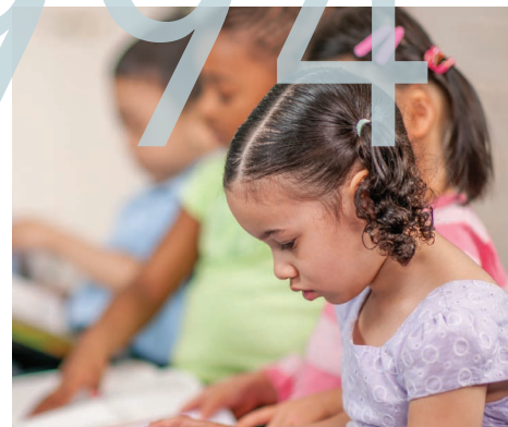
2016-20 Number of endowments grew to 278. Assets held grew to $58,139,589.