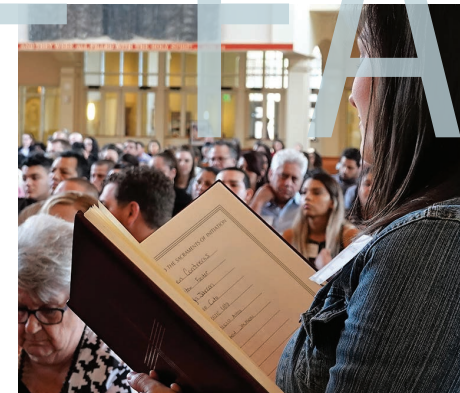
2006-10 Number of endowments grew to 182. Assets held grew to $16,887,446.