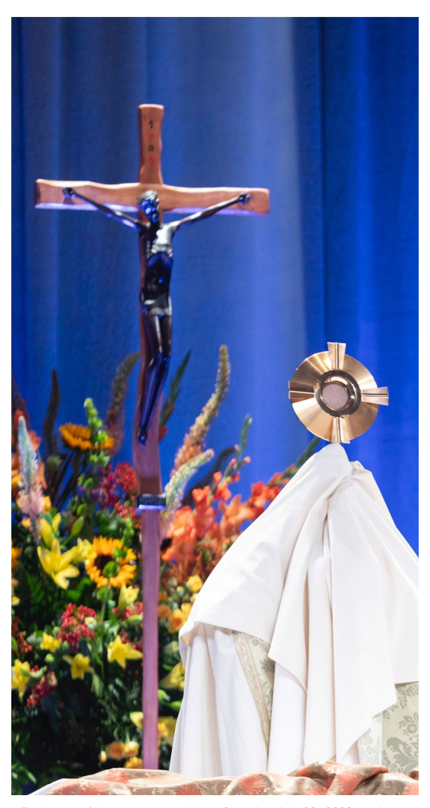
Eucharistic Adoration was held on Saturday, July 22, 2023, and met with great enthusiasm from the young adults present.