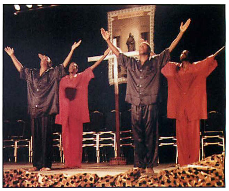
The Ninth National Black Catholic Congress celebrated a solidarity of purpose, from the general sessions, to the breakout sessions, the discussions, the prayers and the singing proved unifying under the theme of dedication and love.

The theme was "Leadership for the 21st Century: Solidarity in Action". In a masterful and highly participatory dynamic, the 3000 delegates crafted "The Pastoral Plan of Action", highlighting implementation suggestions around eight Principles including Africa, Catholic Education, HIV/AIDS, Parish Life, Racism, Social Justice, Spirituality and Youth and Young Adults. This was a working Congress, identifying key issues that impact evangelization within Black Catholic Communities. A Financial Collection was held to assist families and individuals who were affected by HIV/AIDS as well as to develop resources on this topic.