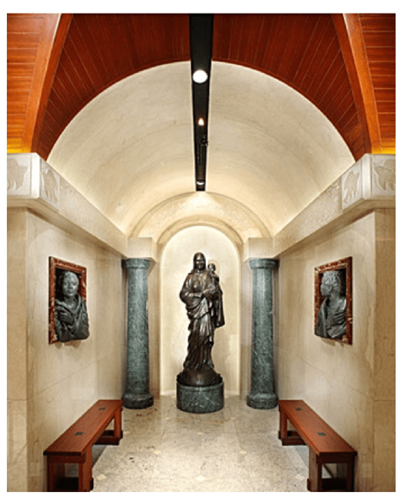
The Eighth Congress celebrates the opening of the "Our Mother of Africa Chapel," located within the Basilica of the National Shrine of the Immaculate Conception in Washington, DC.