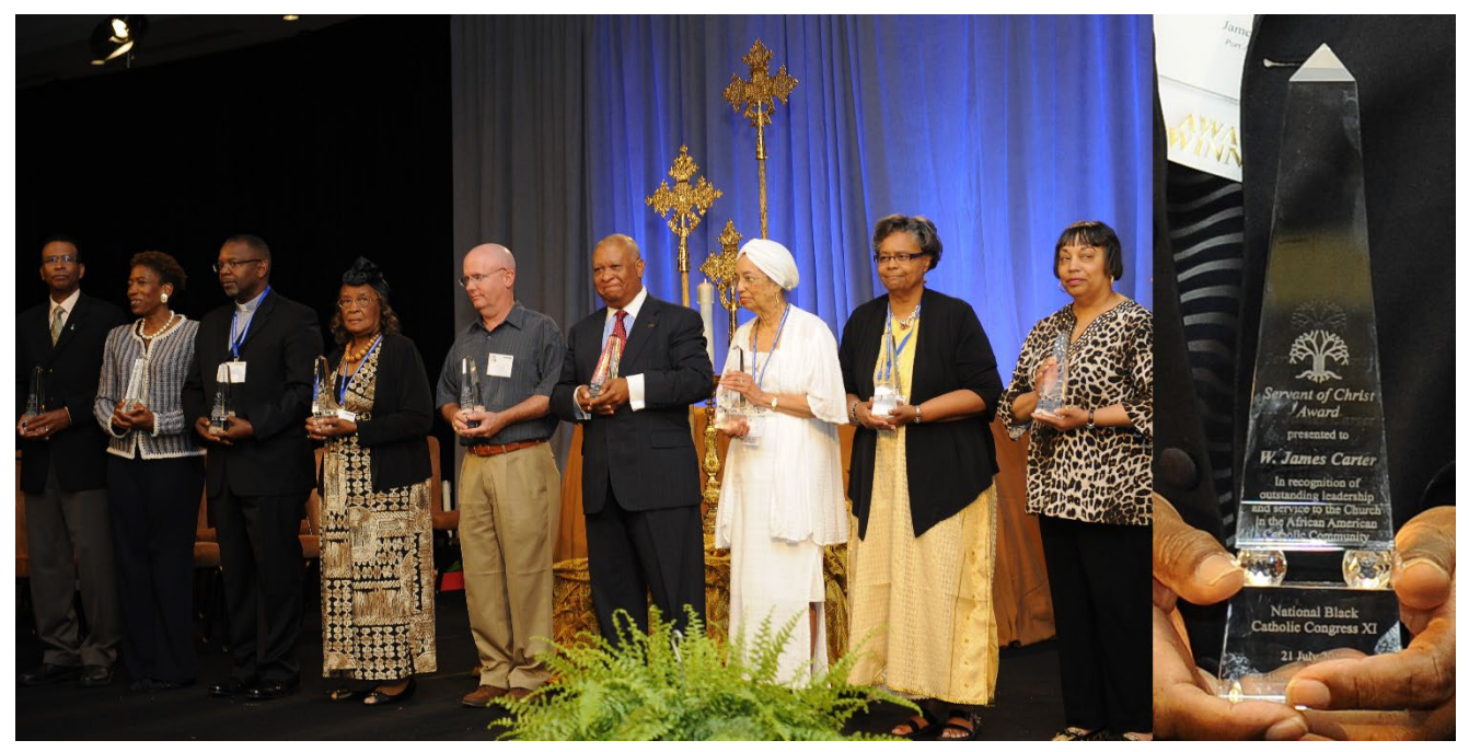
The Congress XI gathering culminated in an awards ceremony where many "Servants of Christ" received recognition for their ministry to the Black Catholic community.

This Congress celebrated 25 years of gathering together as a Congress in modern times. The theme was "Faith Engaged: Empower, Equip, Evangelize". The Congress celebrated the Black Bishops Pastoral Letter, What We Have Seen and Heard. It also celebrated Black Catholic leaders who are working hard to implement the initiatives of NBCC Pastoral Plans as well as those actions stated in What We Have Seen and Heard. The Gathering illustrated the gains met during the Congress movement. It also centered on the oppressive burdens still haunting our efforts of healing and renewal warranted for us to evangelize. We lean on the "good news" of the Gospel to bring hope and strength. This is needed so that we may press forward until the life and dignity of every person in the community is honored and respected. As in almost every Congress from the beginning of it's conception in 1889, the hope of racial equality while battling racism became one of the most obstinate barriers of evangelization. The event culminated in an award ceremony, where those with distinguished ministry to the Black Catholic community were presernted with "Servant of Christ" awards.