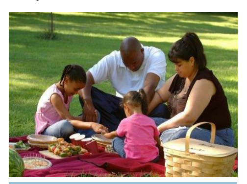
"...the FAMILY that PRAYS together STAYS together." -Pope Francis-

tween safe and unsafe situations. You will receive a letter that will give you valuable information to discuss unsafe situations with your child.