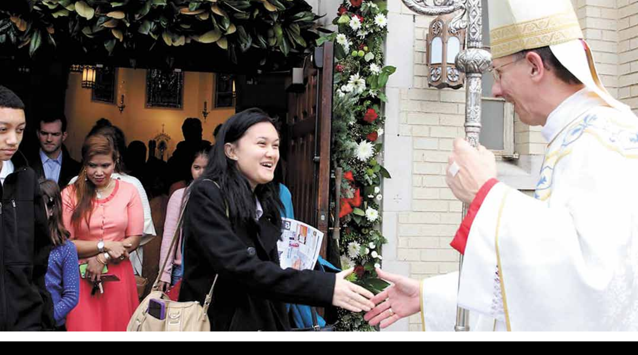
We are merciful in word and action.